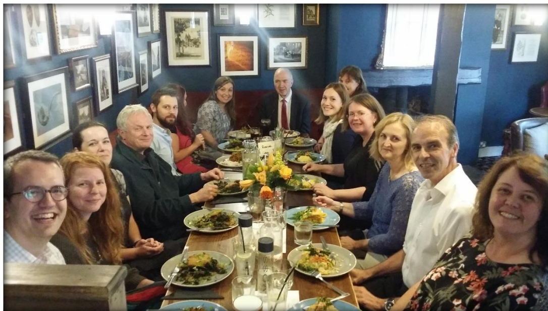
Vegan lunch with some colleagues at the restaurant The Red Lion in Godalming